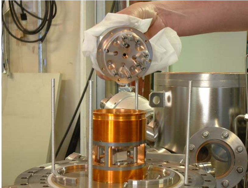
Figure 4. Removal of the objective housing from the analyzer.