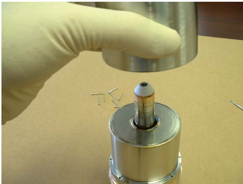
Figure 7. Removal of the nose cap.