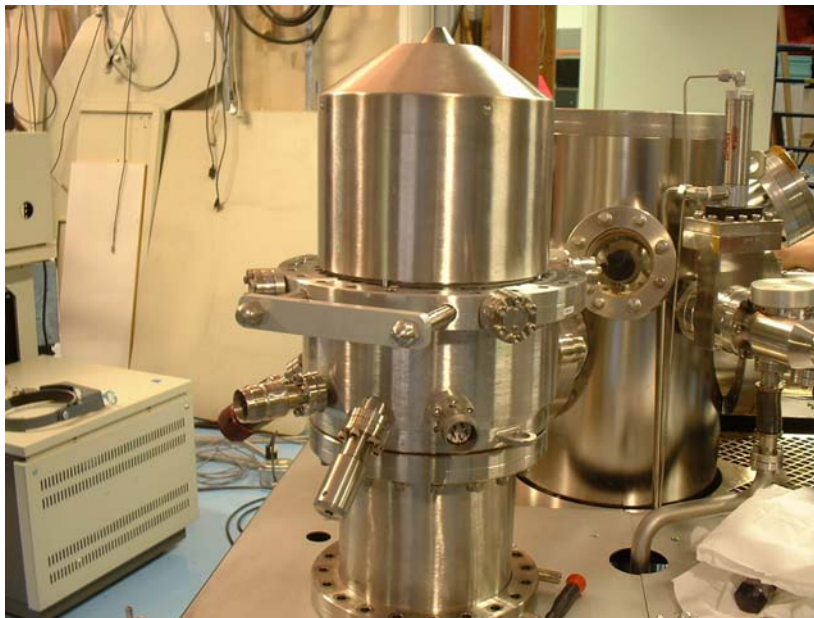
Figure 1. Analyzer placed on condenser nipple after removal of filament housing.