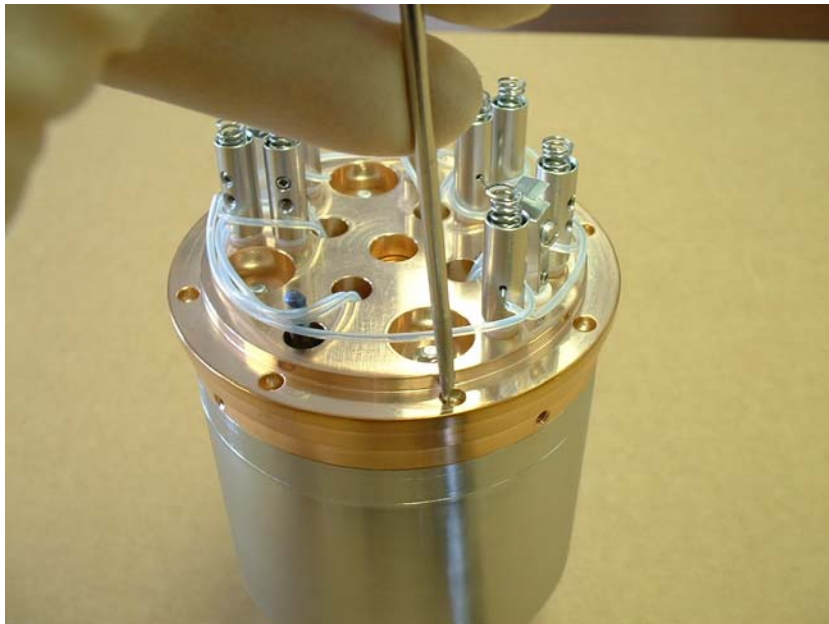
Figure 6. Removing the 8 screws which hold the nose cap in place.