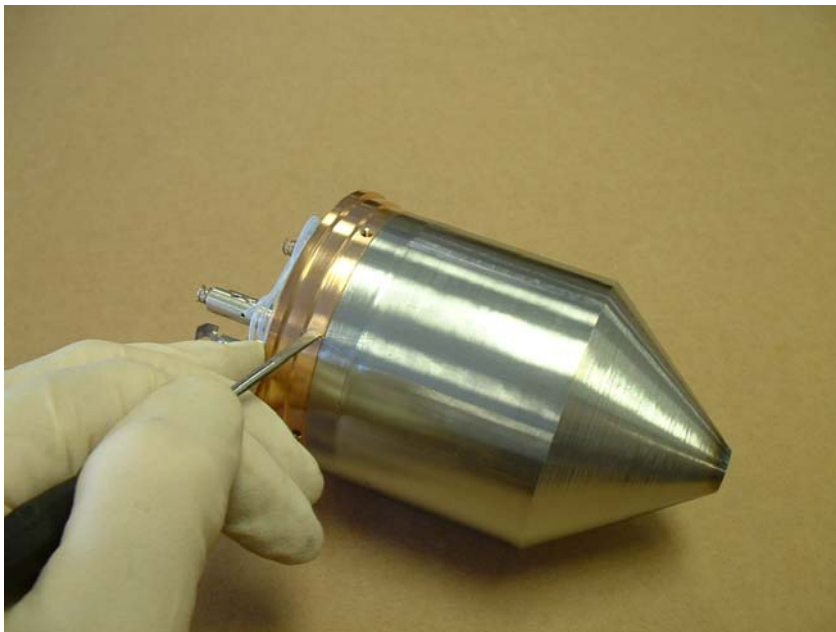
Figure 5. Scribe the objective assembly so that the nose cap may be realigned during reassembly.